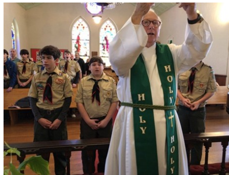
Helping with the Collection