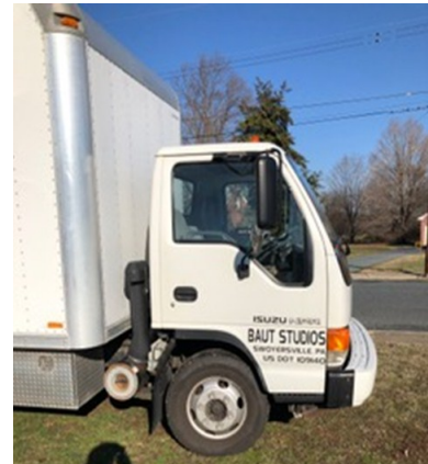
The Baut Studio truck—when you see it next, the repair and protection work will continue.