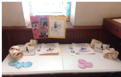
Some of the items created by the Sunday School to tell John Wesley's story.