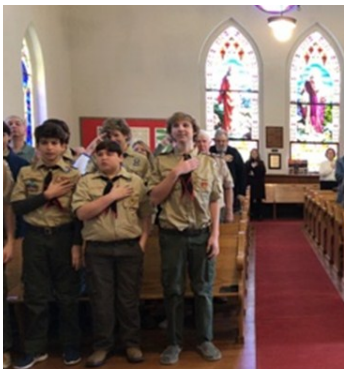
Pledge of Allegiance