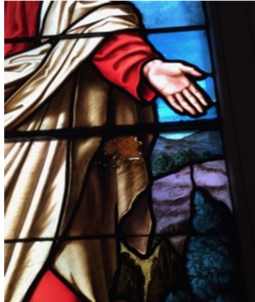
Before—one of the panes removed for repair.