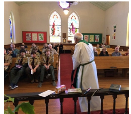
"What's in your Backpack?"