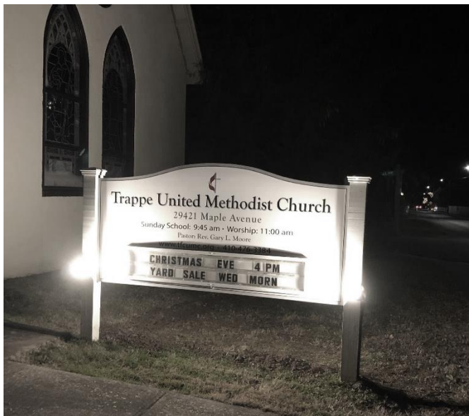
New lighting for the church sign.

The next Tidings will be published in June for June, July, and August . Deadline will be May 15 . Your news, information, announcements, pictures, and creativity are welcome!