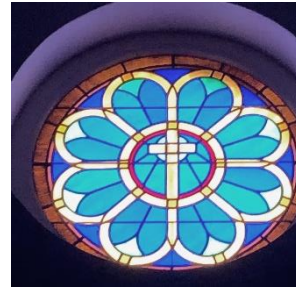
The Rose Window is finally illuminated!