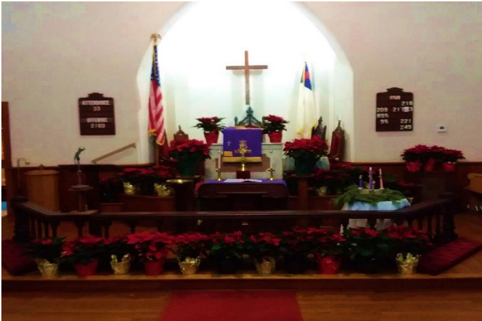
Glorious Christmas 2021 poinsettias: Thanks to all who contributed!