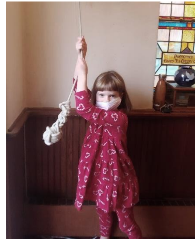
Our Bell Ringer and Greeter on Christmas Eve!