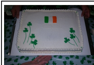
Leprechauns, green decorations and good food!