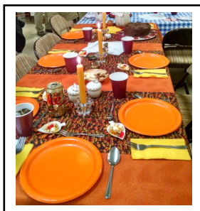
A table for each month