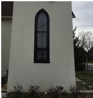
Cover and new frame installed

A huge Thank You to Baut Studios, Bernie, and Lorenzo! Contributions to the Window Fund are still welcome!