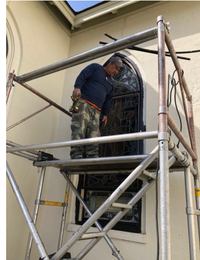
Installing a cover