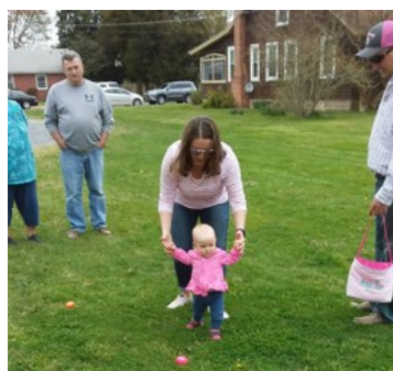
Can you find the eggs? Someone in pink found one!