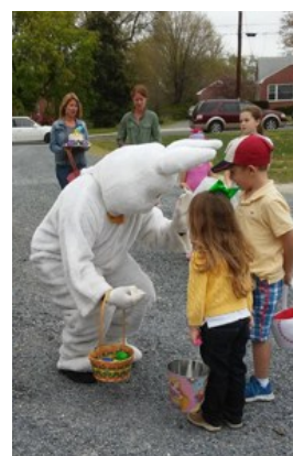
A very popular Bunny!