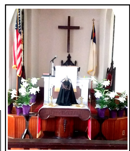
Trappe UMC Altar at Easter