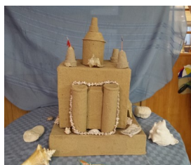
Charlotte's Sand Castle