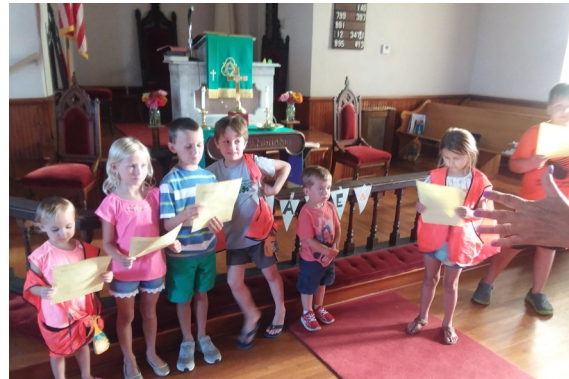
VBSers singing and reciting the Bible verse