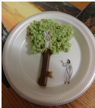
Craft Project: Jesus telling Zacchaeus to come down