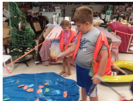
Fishing at VBS camp