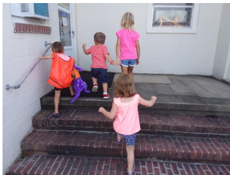
Can't wait to get to VBS!