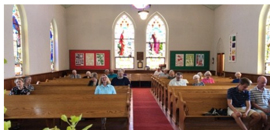
Our Congregation during the August 25 sermon.