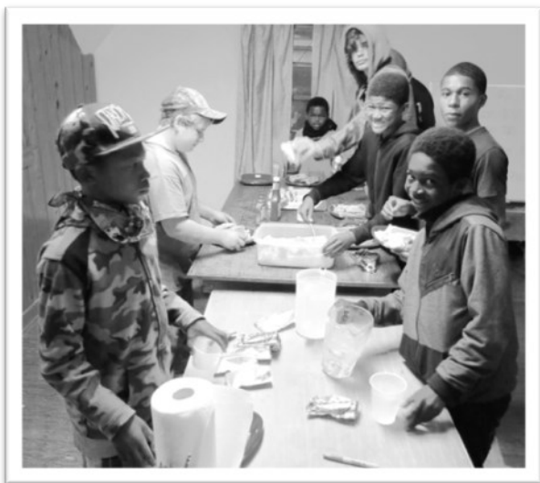
Pictures from October's meeting: The youths' two favorite activities are eating and ping pong!